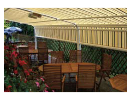
Above left The Grapes, London. Above The Queens Head, Malpas, North Wales.