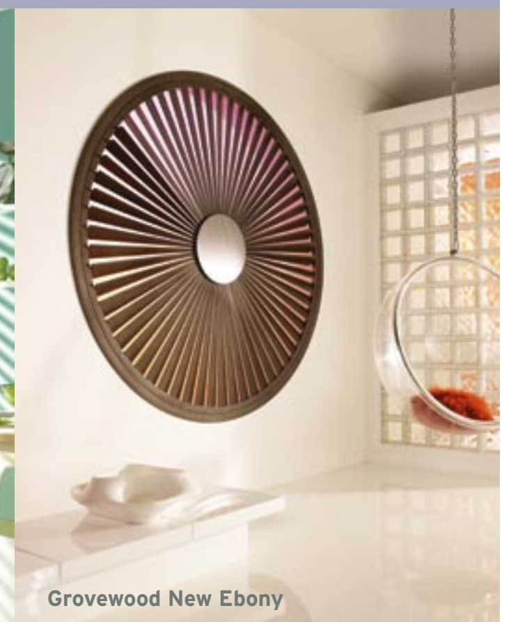
Groewood New Ebony