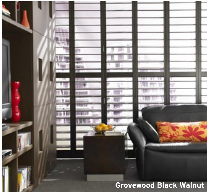
Groewood Black Walnut