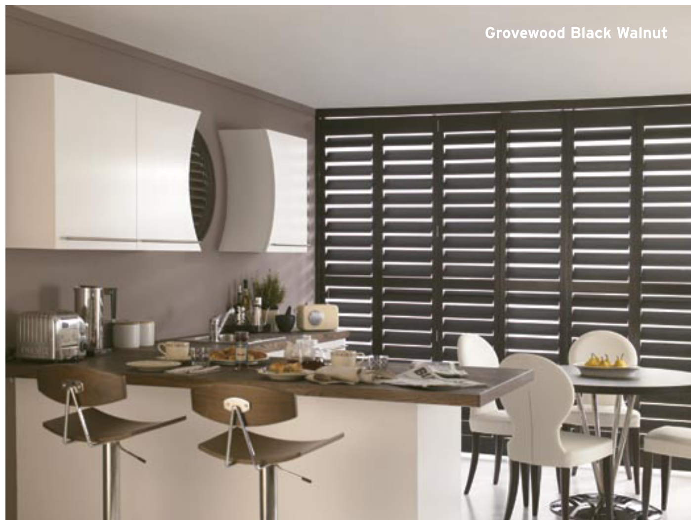
Grovewood Black Walnut

Louvre size depends on the size of the window and the effect you want to achieve. As a general rule, wider louvres work better on larger windows as they let in more light and smaller louvre sizes offer greater privacy.