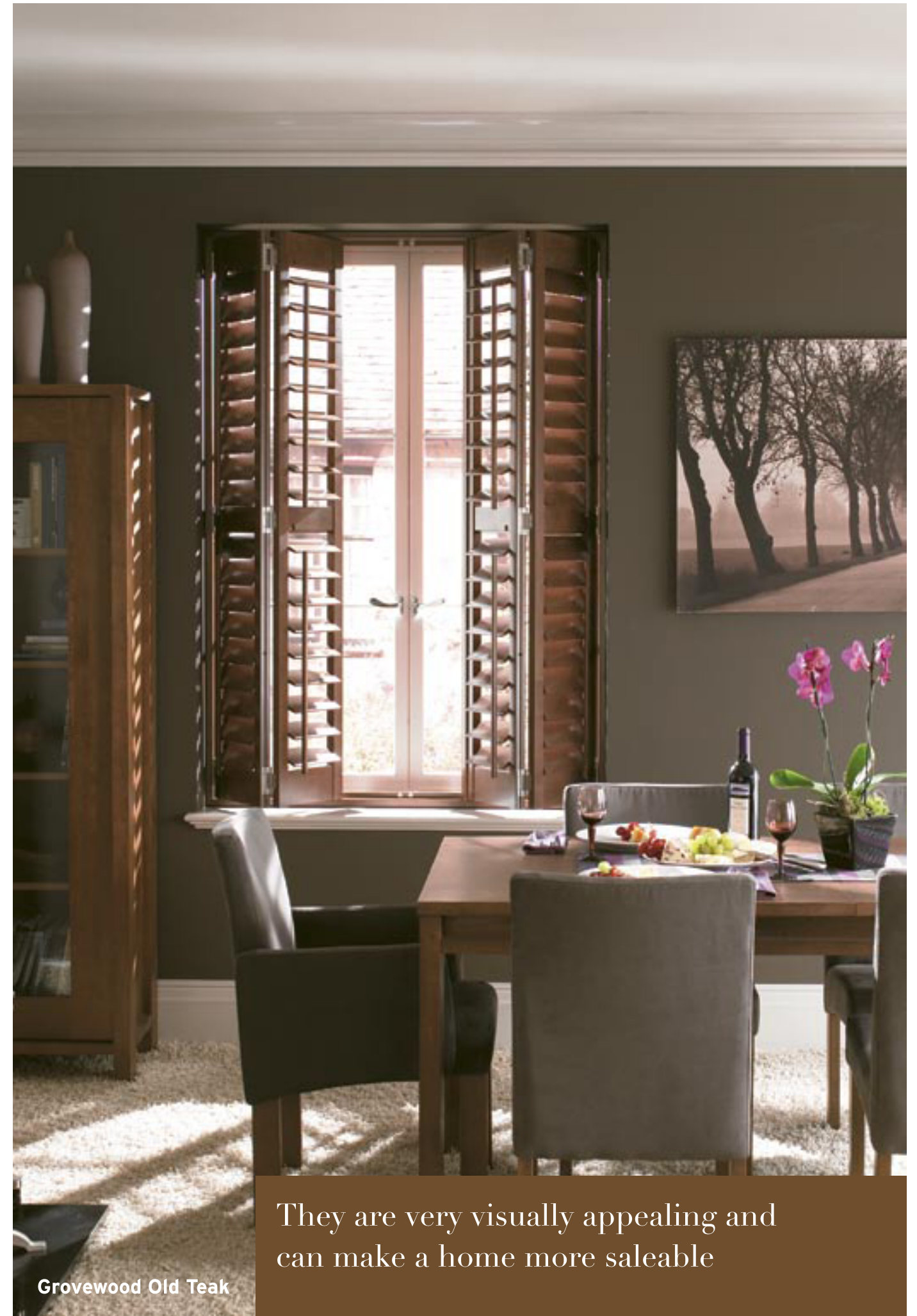
Groewood Old Teak

They are very visually appealing and can make a home more saleable