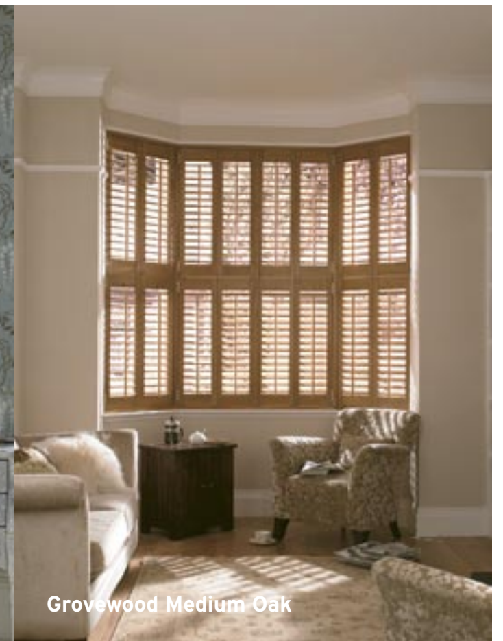
Groewood Medium Oak