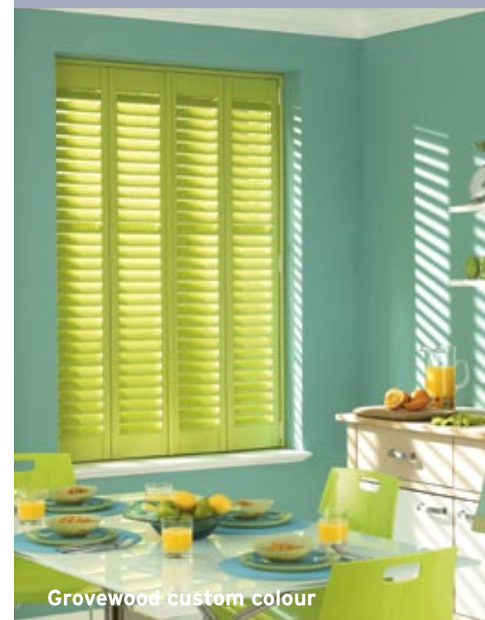
Groewood custom colour